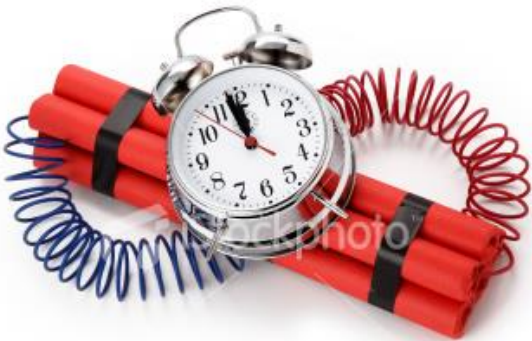
This Photo licensed under CC BY-SA